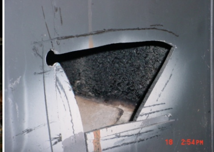
Above are example images of older stoves which have been rendered inoperable by cutting a whole in the firebox.