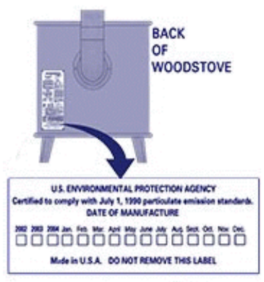
Permanent Wood Stove Label affixed to a stove