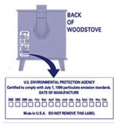
Permanent Wood Stove Label (typically affixed to the back of a stove)