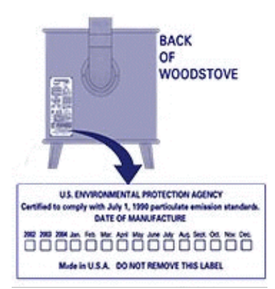
Permanent Wood Stove Label affixed to a stove